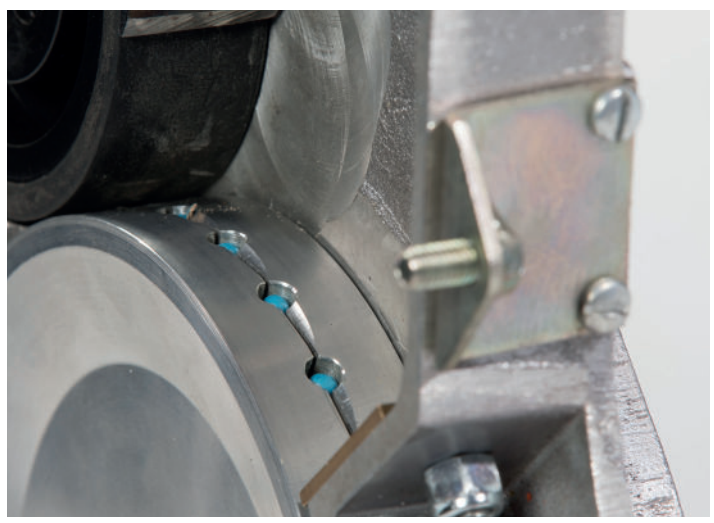
The metering unit is available in one chassis with two different drive options, mechanical and electric drive.